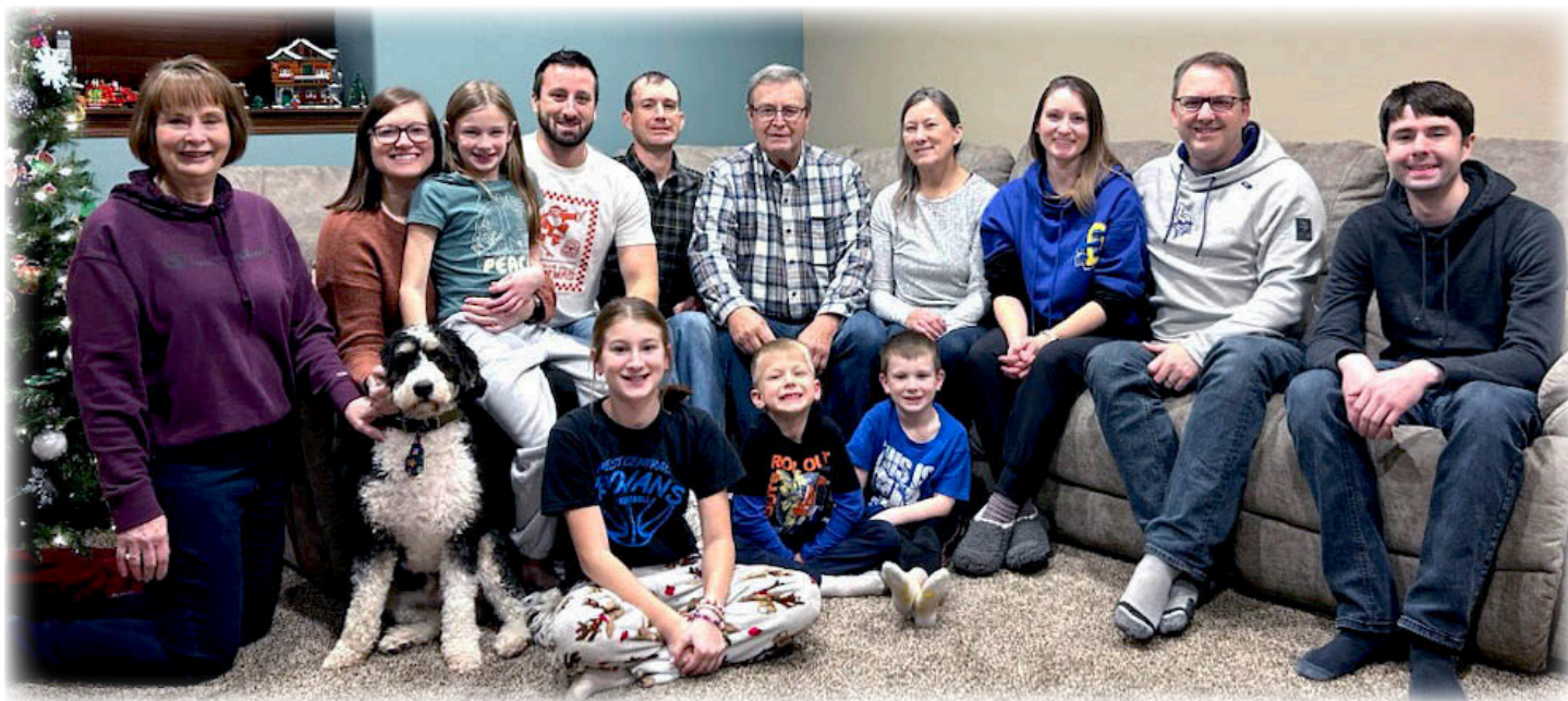
Benda Family Christmas 2024

Once again we will have videos of the bulls on our website and on the DVAuction site late January. Feel free to give us a call anytime or stop by the ranch prior to the sale to evaluate the bulls. Hope to see you Feb. 10 in Kimball.