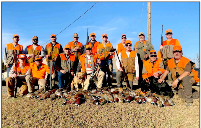
2024 Pheasant Hunt